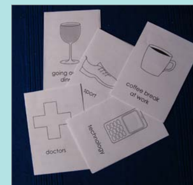
Cultural Probe Kits